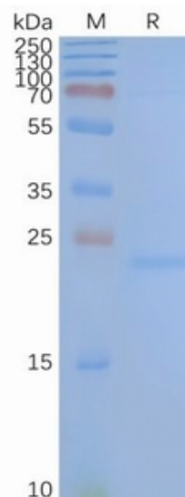
Figure2. Human TM4SF1-Nanodisc, Flag Tag on SDS-PAGE

Figure1. Elisa plates were pre-coated with Flag Tag TM4SF1-Nanodisc (0.2 µg/per well). Serial diluted anti-TM4SF1 monoclonal antibody (28151) solutions were added, washed, and incubated with secondary antibody before Elisa reading. From above data, the EC50 for anti-TM4SF1 monoclonal antibody binding with TM4SF1-Nanodisc is 15.97ng/ml.