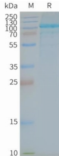
Figure2. Human TLR5-Nanodisc, Flag Tag on SDS-PAGE