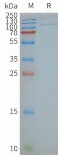
Figure2. Human TLR4-Nanodisc, Flag Tag on SDS-PAGE