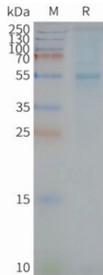
Figure2. Human STEAP2-Nanodisc, Flag Tag on SDS-PAGE