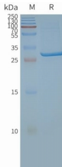
Figure2. Human SLC25A4-Nanodisc, Flag Tag on SDS-PAGE