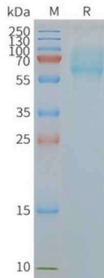
Figure2. Human SLC1A5-Nanodisc, Flag Tag on SDS-PAGE