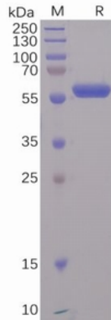
Figure 1. SARS-CoV-2 (2019-nCoV) S protein RBD, mFc Tag on SDS-PAGE under reducing condition.