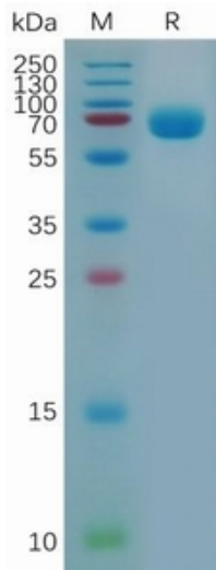
Figure 1. Mouse B7-H3 Protein, hFc Tag on SDS-PAGE under reducing condition.