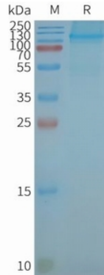
Figure2. Human LGR5-Nanodisc, Flag Tag on SDS-PAGE