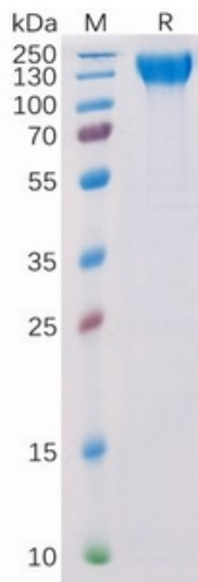
Figure 1. Human VEGFR2 Protein, His Tag on SDS-PAGE under reducing condition.