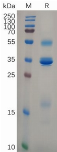
Figure 1. Human TSLP Protein, hFc Tag on SDS-PAGE under reducing condition.