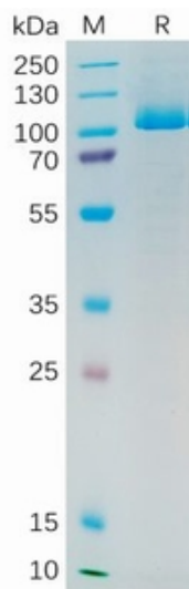
Figure 1. Human PSMA Protein, His Tag on SDS-PAGE under reducing condition.