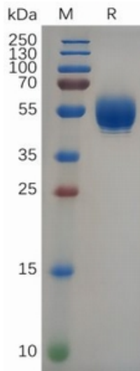
Figure 1. Human IL22 Protein, hFc Tag on SDS-PAGE under reducing condition.