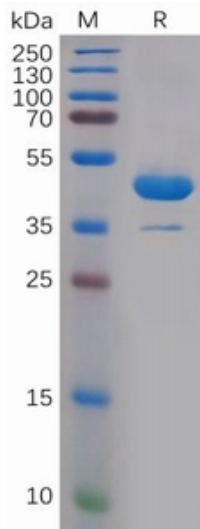
Figure 1. Human IL1A Protein, hFc Tag on SDS-PAGE under reducing condition.