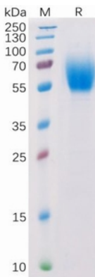
Figure 1. Human IL13RA1 Protein, His Tag on SDS-PAGE under reducing condition.

储存和运输: Store at -20°C to -80°C for 12 months in lyophilized form. After reconstitution, if not intended for use within a month, aliquot and store at -80°C (Avoid repeated freezing and thawing). Lyophilized proteins are shipped at ambient temperature.