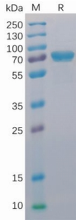
Figure 1. Human CD40 Protein, mFc-His Tag on SDS-PAGE under reducing condition.