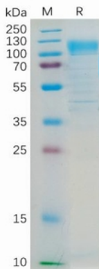
Figure 1. Human CD36 Protein, hFc Tag on SDS-PAGE under reducing condition.

储存和运输: Store at -20°C to -80°C for 12 months in lyophilized form. After reconstitution, if not intended for use within a month, aliquot and store at -80°C (Avoid repeated freezing and thawing). Lyophilized proteins are shipped at ambient temperature.