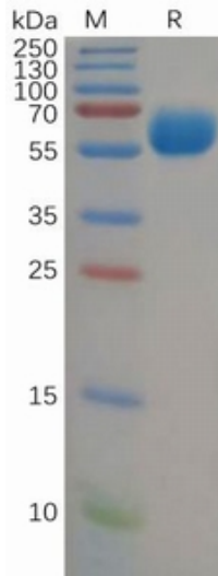
Figure 1. Human B7-H5 Protein, hFc Tag on SDS-PAGE under reducing condition.