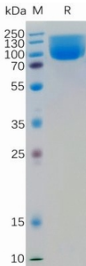
Figure 1. Human B7-H4 Protein, hFc Tag on SDS-PAGE under reducing condition.