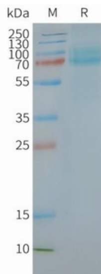
Figure2. Human FZD10-Nanodisc, Flag Tag on SDS-PAGE