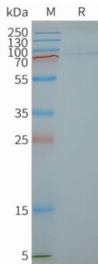
Figure2. Human FSHR-Nanodisc, Flag Tag on SDS-PAGE