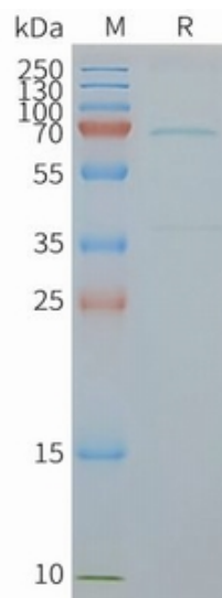
Figure2. Human ENTPD2-Nanodisc, Flag Tag on SDS-PAGE