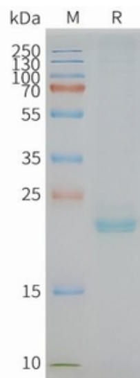
Figure2. Human CLDN3-Nanodisc, Flag Tag on SDS-PAGE