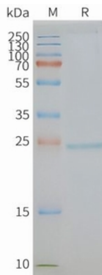
Figure2. Human CD81-Nanodisc, Flag Tag on SDS-PAGE