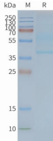
Figure2. Human CD47-Nanodisc, Flag Tag on SDS-PAGE