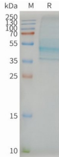
Figure2. Human CCR7-Nanodisc, Flag Tag on SDS-PAGE