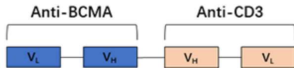
Figure 2. A: The scheme of Anti-BCMA BiTE molecule. B: Tumor cell killing assay. NCI-H929 cells (stably transfected with luciferase), were incubated with freshly isolated human PBMC, and different concentration of BiTE antibodies constructed from rabbit Anti-Human BCMA/TNFRSF17 Clone DM4 (red line), or BB2121 originated huC11D5.3 clone (blue line) or a no BCMA binding clone as negative control (black line). After 48hrs incubation, the viable NCI-H929 tumor cells were measured by luciferase activity assay.