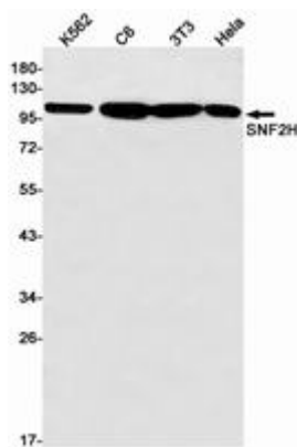
Western blot analysis of SNF2H in K562, C6, 3T3, HeLa lysates using SNF2H antibody.