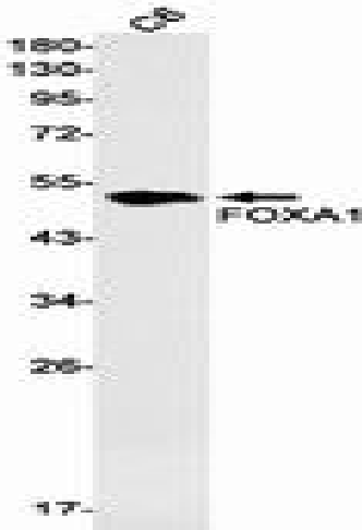
Western blot analysis of FOXA1 in C6 lysates using FOXA1 antibody.