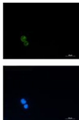
Immunocytochemistry analysis of CD3G (green) in Jurkat using CD3G antibody, and DAPI (blue).